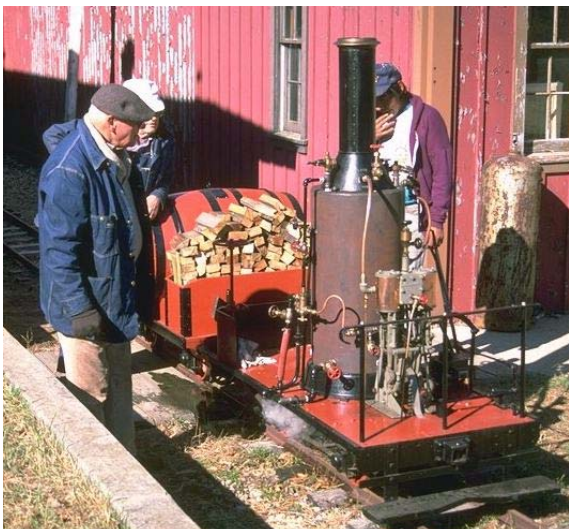
An engine with a vertical boiler is like an eccentric cousin . . . always a bit odd, but you really enjoy having it around.