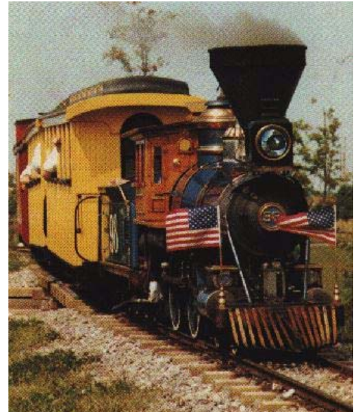
A recent photo of 98 shows her at the Old Wakarusa Railroad.